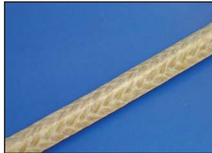
SEPCO STYLE RV 2225